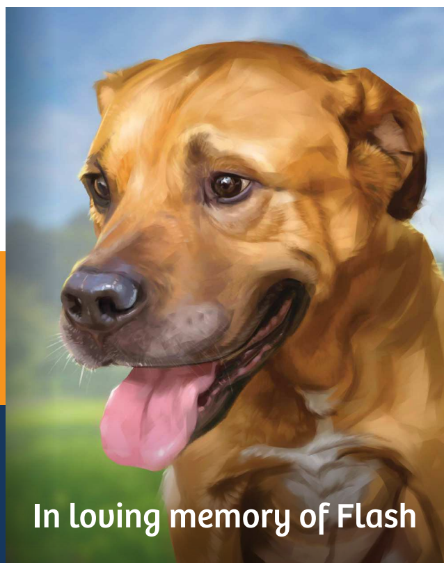
In loving memory of Flash

To understand your pet's nutritional requirements is important in choosing the right food. At Lucky Flash Pet Feeds, it is our mission to assist every pet parent with the correct food based on their furry baby's life stage and needs, while keeping the budget in mind. It is important not to change feeds every month but rather make an informed decision to feed the same brand long-term.”